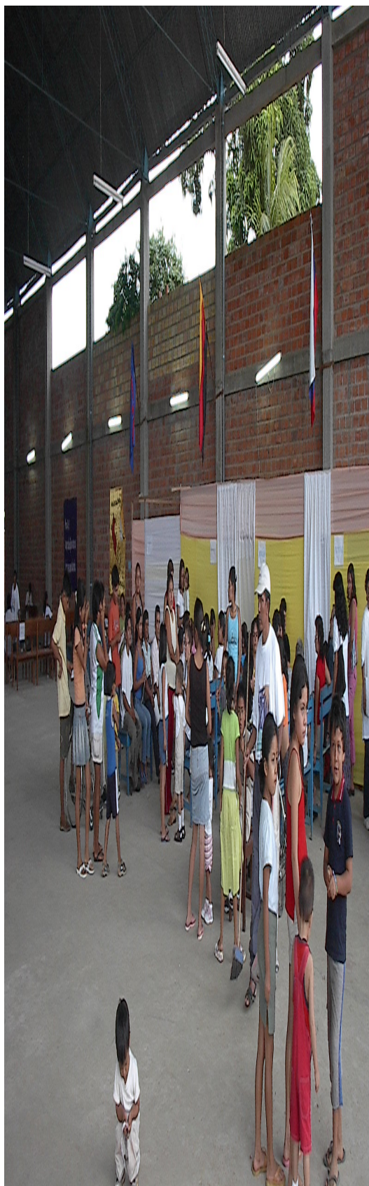
Persons waiting for a medical consultation in the Dalton medical campaign in Tarapoto.