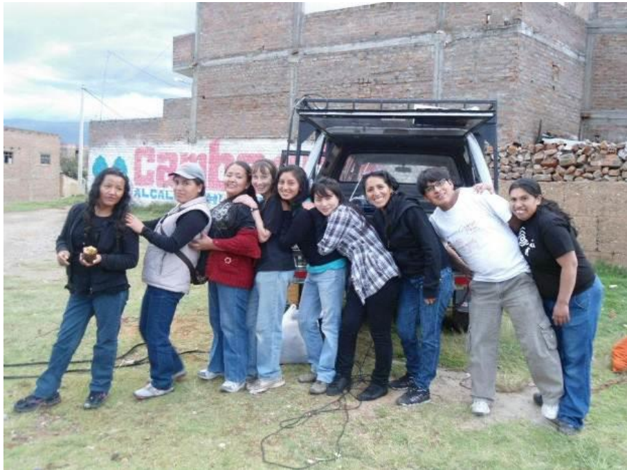
Pichcus Kid's Club Teachers

For the Kid's Club in Pichcus for Christmas, we celebrated having a birthday party for the Lord Jesus. The kid's enjoyed playing some games, and the teachers acted out a drama and performed a special choreography for the children with a song that tells the story of Jesus. After that we all danced around to a song called "The Train of Salvation," while we sprayed white foam and scattered confetti over everyone. Last of all, we all ate the special Christmas bread, Panetón, and drank the homemade hot chocolate.