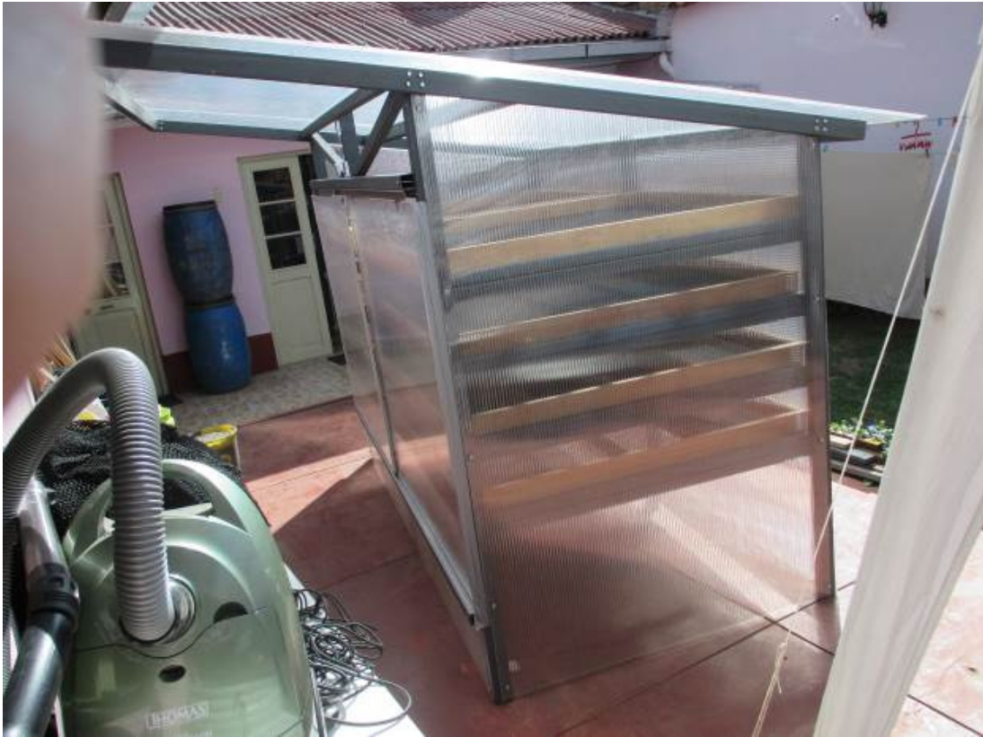
Tower section of the solar cacao dryer.

additional materials. If the dryer works well, they will build 23 more over a period of the next two to four years to use on the farm to dry the chocolate beans. A hard working short term team could probably build one of these in a week in Huancayo. It would then be taken apart, shipped to the jungle, and reassembled on the farm with only hand tools. Thank you for your prayers for this project, and please continue praying that the dryers will work well on the farm in the jungle.