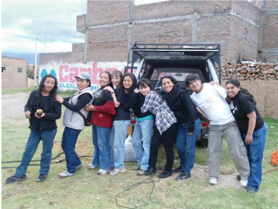
Pichcus Kid's Club Teachers

For the Kid's Club in Pichcus for Christmas, we celebrated having a birthday party for the Lord Jesus. The kid's enjoyed playing some games, and the teachers acted out a drama and performed a special choreography for the children with a song that tells the story of Jesus. After that we all danced around to a song called "The Train of Salvation," while we sprayed white foam and scattered confetti over everyone. Last of all, we all ate the special Christmas bread, Panetón, and drank the homemade hot chocolate.