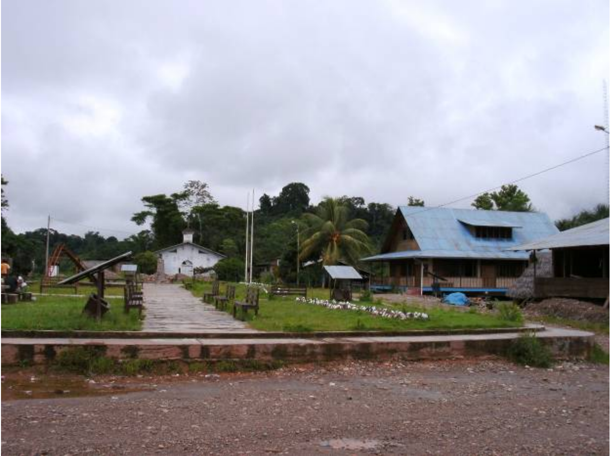
Town Square in Mayro.