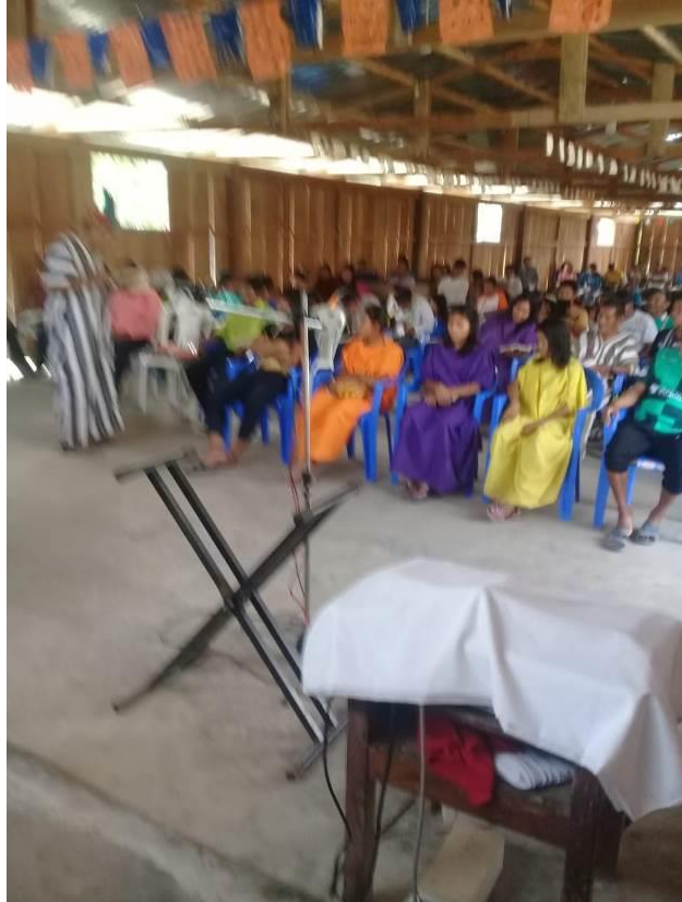
Celebration in the new meeting place in Boca Anapati.