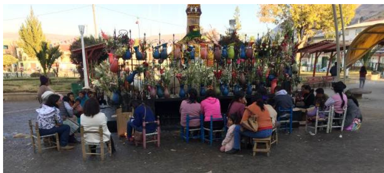
People worshipping the Cani Cruz.