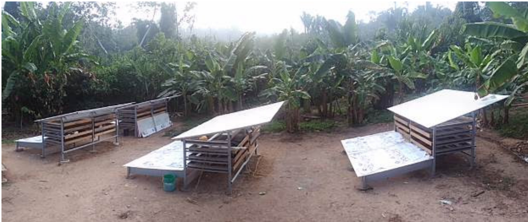
Partial installation of four cacao dryers.