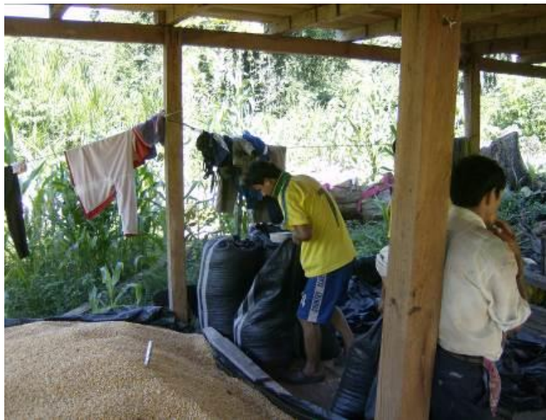
Harvested corn being bagged for the market.