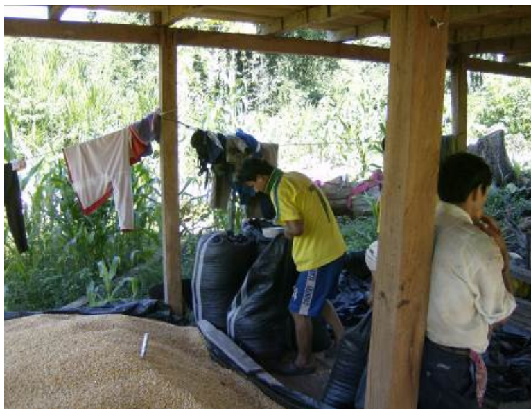
Harvested corn being bagged for the market.