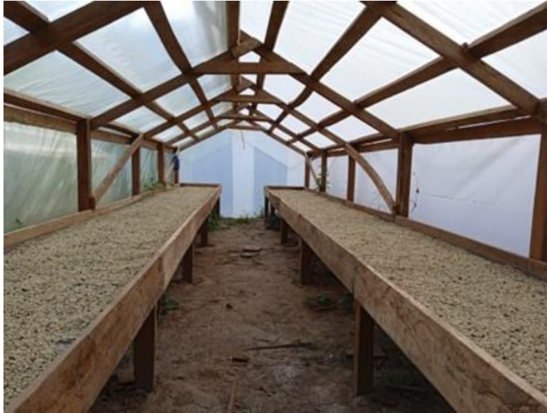
Coffee drying in one of the dryers.

We have started harvesting coffee, but we are having difficulty finding enough workers. The weather has been rainy which is slowing the process, as well. The coffee dries more slowly when the weather is cloudy and rainy. The price for coffee is up some. We are still in the low season for cacao, but there is still production, and we are still harvesting. The price of cacao has dropped from S/.35.00 to S/29.50, but is still much higher than it has ever been. The farm team sprayed the cacao plants and are cleaning out the undergrowth in preparation for the large harvest season, which will begin in May or June. It appears that the farm will have much better production this year and if the prices hold, it should be a good year. The new banana plants are growing well and should start producing in July or August. Please pray for an abundant harvest that only God can give, and for workers for the harvest.