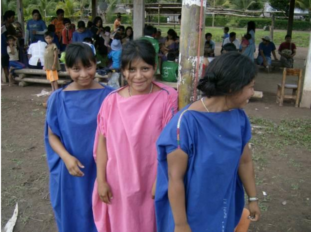
Three young Ashánika ladies from the Boca Anapati community.