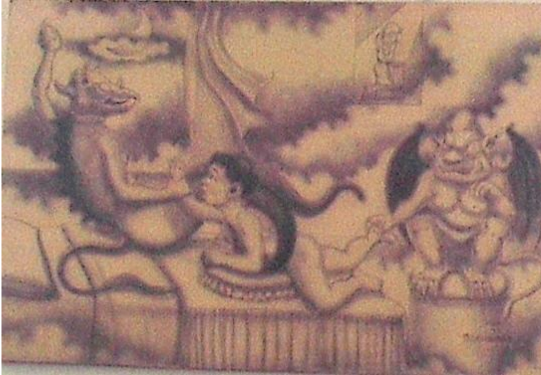
Drawing on public display in the library of Huancayo.

The last Friday of every month we go out into the streets to pray. The last prayer outing several interesting things happened. One of our prayer groups was kneeling on the side walk praying, when a man that appeared very drunk walked by. Five steps or so after he passed the prayer team, he turned around and with the drunken stupor gone from his face he said to the prayer team, "You are the reason", and gave them 20 centimos. The next day a young person approached another one of our prayer team members and surprised her by saying, "You were praying for us the other night, weren't you? Please don't stop. It is making a difference."